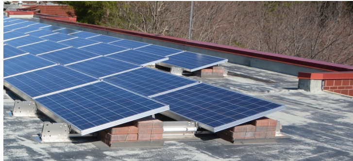
Sullivan Middle School's PV system is composed of groups of solar panels that are placed in various sections of the polygonal flat roof held down with ballasts (here - stacks of bricks).